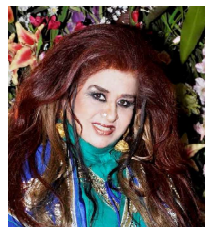
By: Shahnaz Husain

The pleasant days of magical. Monsoons are here again to provide respite from the brunt of the hot and sweaty summer. The buzz of monsoon has grown louder with barren land springs to life with lush green fields and rolling green hills across the country.